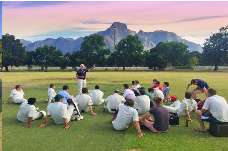
POST-MATCH DRINKS AND HISTORY LESSON