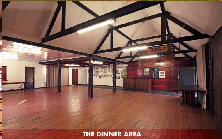
THE DINNER AREA