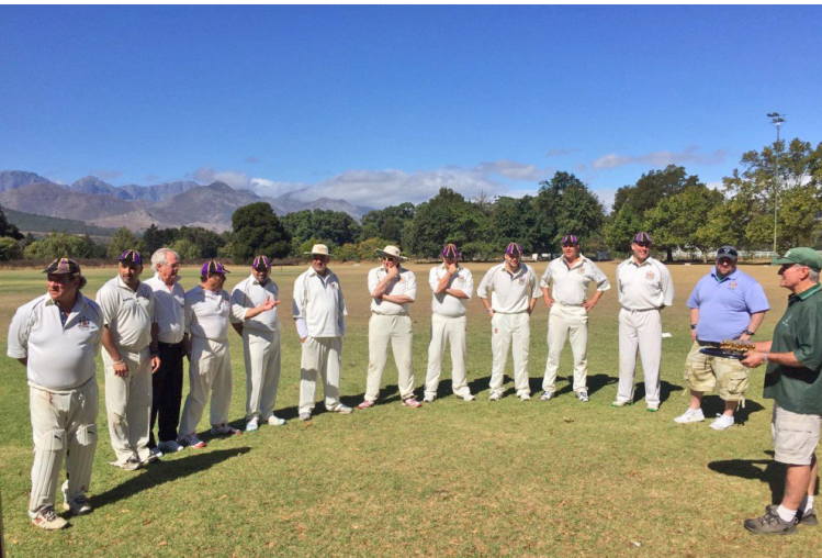
SALUTING THE FLAG