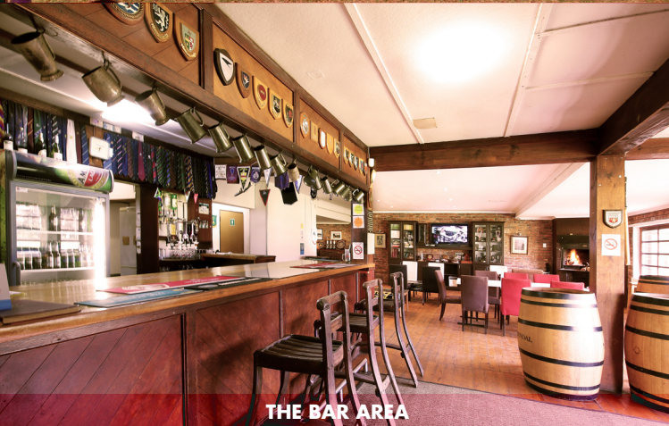
THE BAR AREA